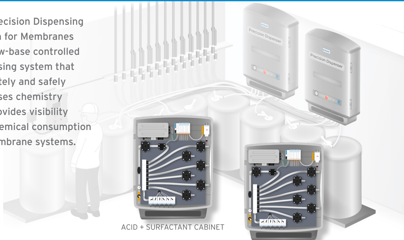
ACID + SURFACTANT CABINET

The Precision Dispensing System for Membranes is a flow-based controlled dispensing system that accurately and safely dispenses chemistry and provides visibility into chemical consumption for membrane systems.